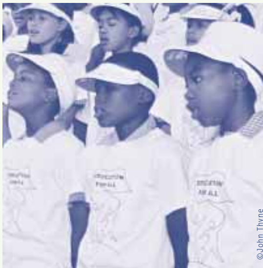
Children at Khomasdal and St. Andrew's Primary Schools in Windhoek, Namibia, sing an education song during EFA Week.

More about EFA Week on www.unesco.org/education/efaweek